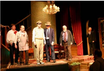
PHOTO GALLERY “YOU CAN’T TAKE IT WITH YOU”