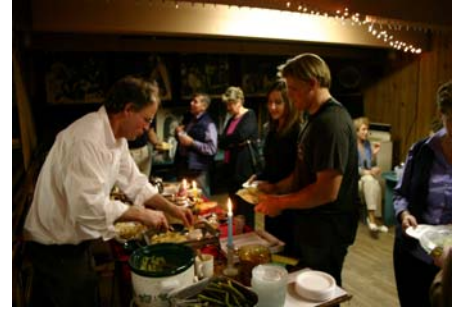
A close look at three of the on-stage participants in “You Can’t Take it With You”. Here they are enjoying the party after the final show.