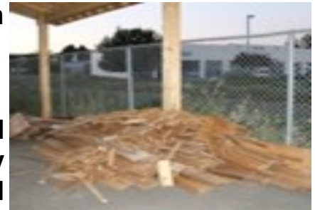
The Last of the Cedar walls

If you can give the team a hand to paint the room once the drywalling is done, you should call Willem at 250-838-6684 and let him know.